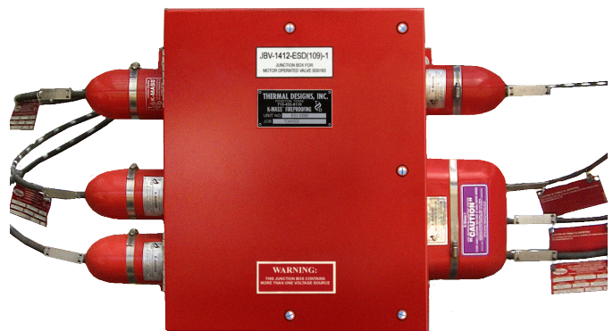
K-CAB with Cable Protectors